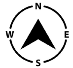
EXHIBIT A Ho-Chunk Clan Circle #0632 Plan Graphic University of Wisconsin-Madison Facilities Planning & Management P:\Common\Planning\POLICIES-GUIDELINES\UW-Guidelines - Ho-Chunk Clan Circle Use